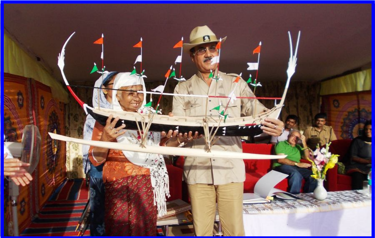
Rani Fathima, Queen of Nancowrie Group of Islands handing over a miniature Hodi to the Hon'ble Lt. Governor, Lt. Gen. (Retd) A.K. Singh during the LG's visit to Kamorta. Hodi is a traditional boat of the Nicobarese Tribes, which is specially crafted and designed to suit the islands' sea conditions. It used to be the only means of transportation to connect different islands in the Nicobar Group. Though the traditional Hodis still exist but is generally restricted to competitions during festivals after the introduction of mechanized boats.